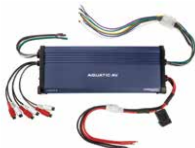
AD600.5 - 5 Channel