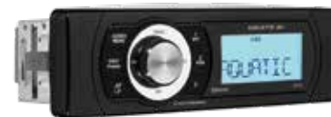
MP6 Shallow Mount Stereo