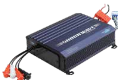
AD600.4 - 4 Channel