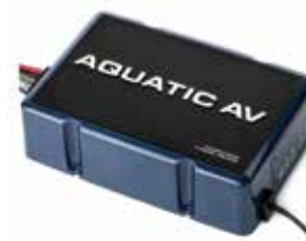
AD300.2 Micro - 2 Channel