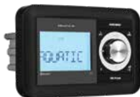
CP6 Compact Stereo