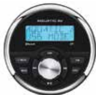
CP1 Gauge Size Stereo